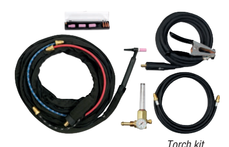
Water-Cooled Torch Kits