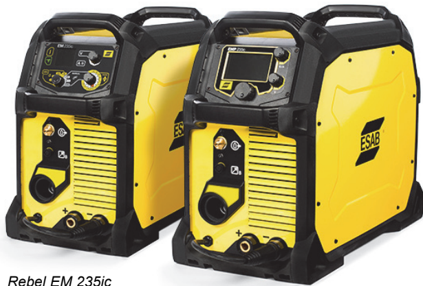
Rebel EM 235ic