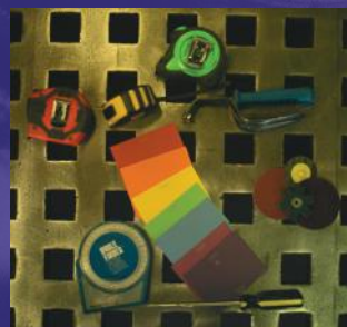
9002NC ADF Shade 3

Improved optics in the Speedglas 9002NC welding filter helps you see your welds in a new light, providing more contrast and natural-looking color as shown in these photos.