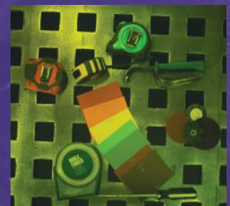
Sample Competitor ADF Shade 3