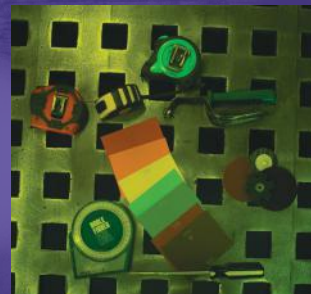
9000X ADF Shade 3