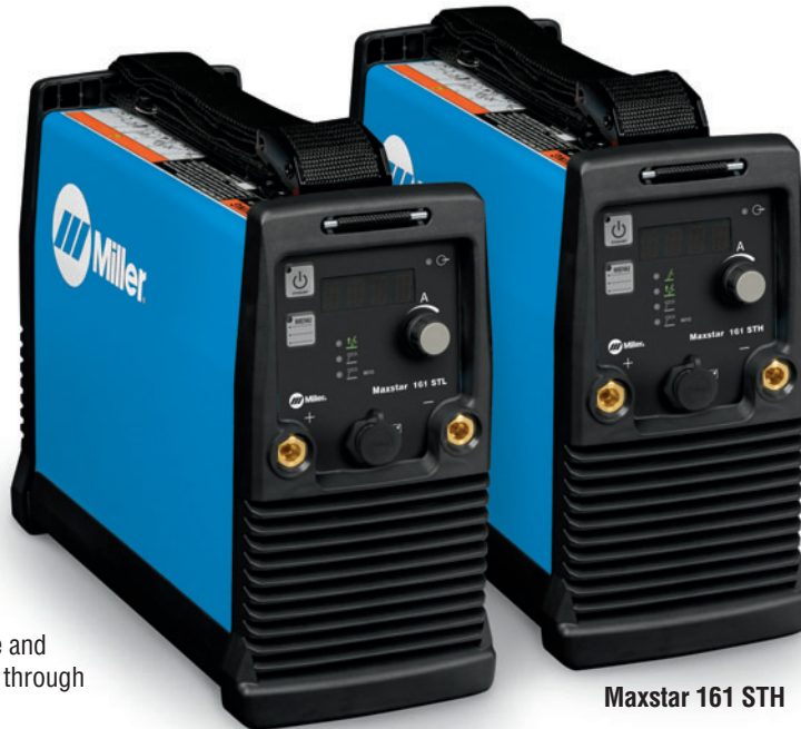
Maxstar 161 STL

Built-in gas solenoid eliminates the need for a bulky torch with a gas valve.