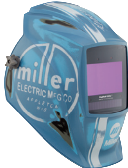
Vintage Roadster™ 289764