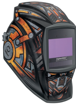
Gear Box™ 289844