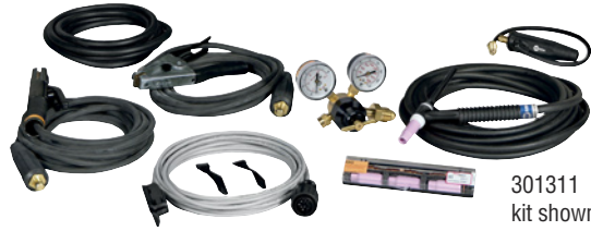
301311 kit shown.