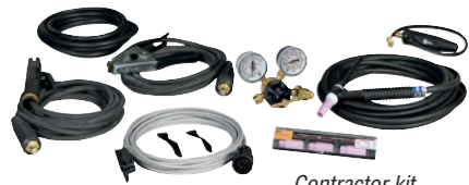
Contractor kit 301311 shown.