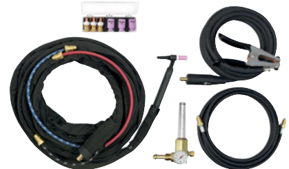
300990 kit shown.