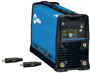
907552 Maxstar shown.

Select desired stock number for each step.