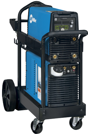
907538002 Maxstar 280 TIGRunner® shown with four bottles of 043810 Low-Conductivity Coolant.

Select desired stock number for each step.