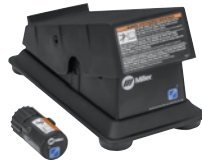
301580 remote shown.