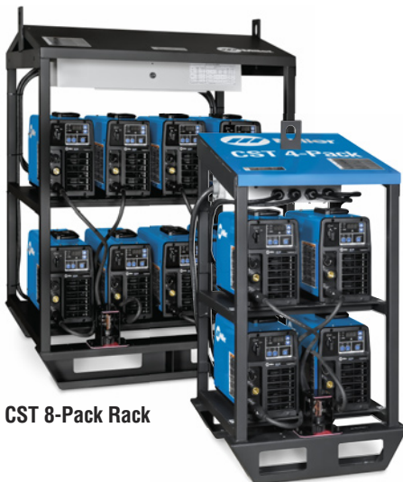
CST 8-Pack Rack