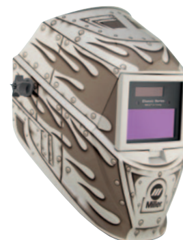
Metalworks™ (VS) 287810