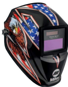
Liberty™ (VS) 287820