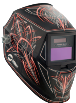
Rise™ (VS) 287815