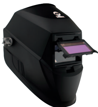
FS#10 Flip-Up 287798