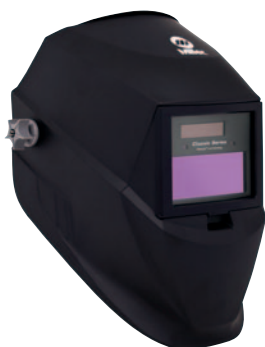
Black (VS) 287803